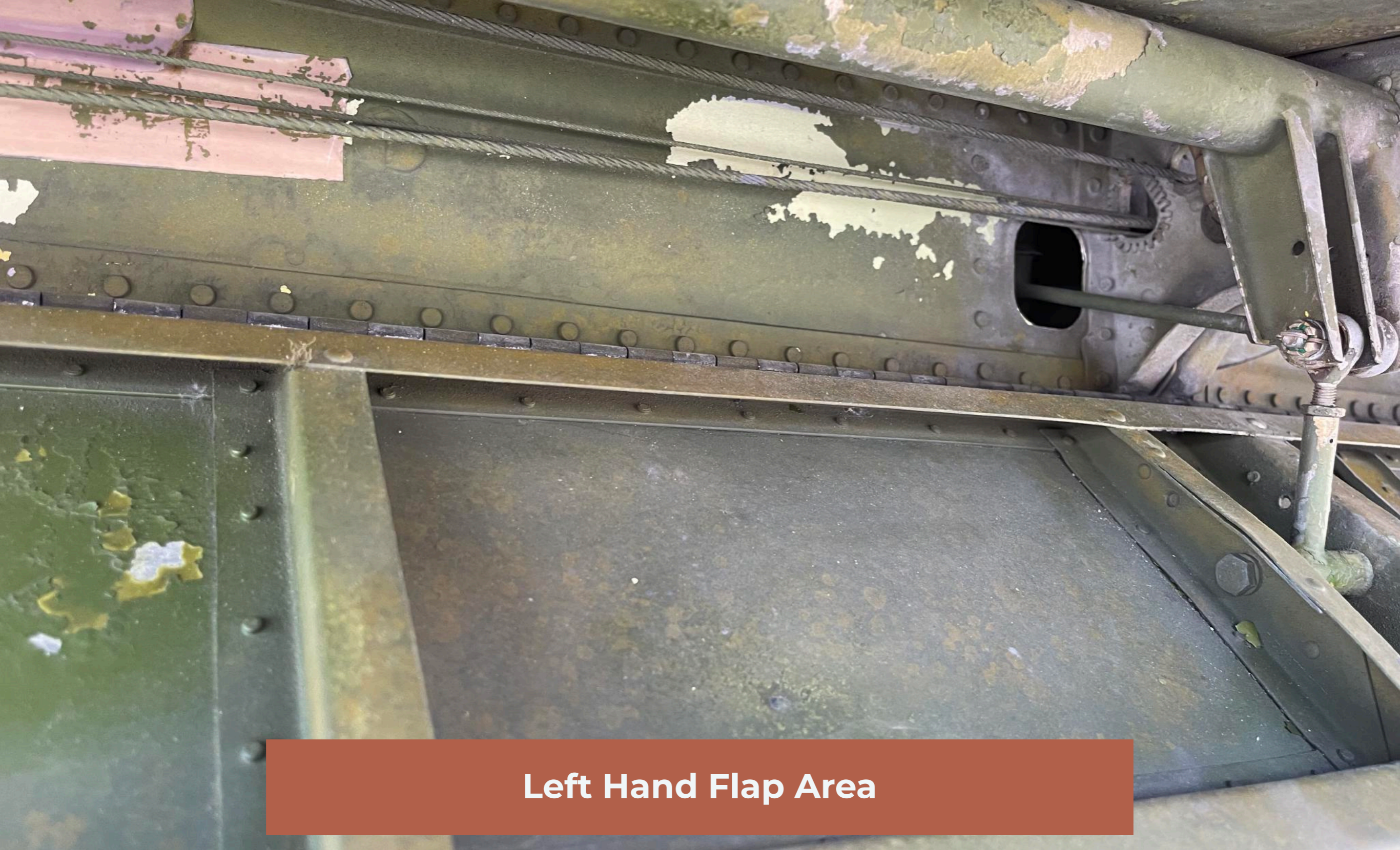
Left Hand Flap Area

1981 Cessna 414AW RAM VII N190MG | SN: 414A-0639