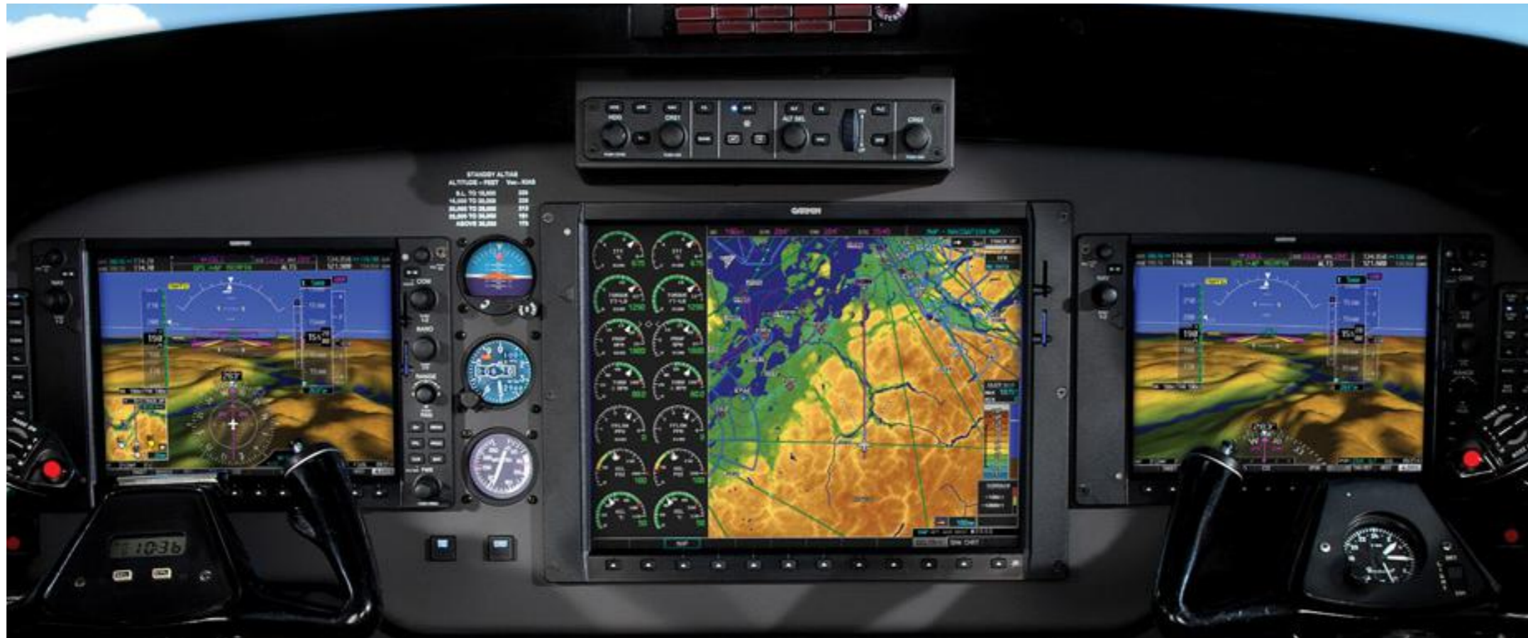
Rendering of a B200 panel with G1000 upgrade installed

Garmin G1000 Package $400,000 (estimated cost)