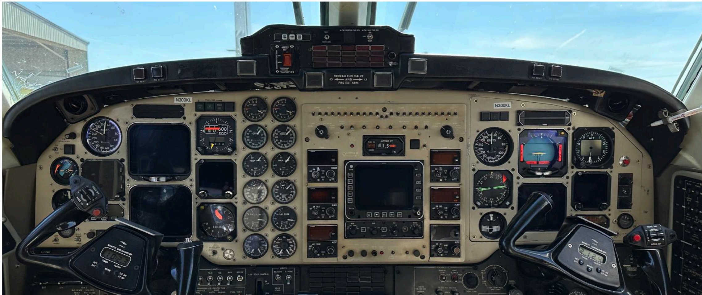
Current panel on FA-39

Retain current panel, add ADS-B $75,000 (estimated cost)